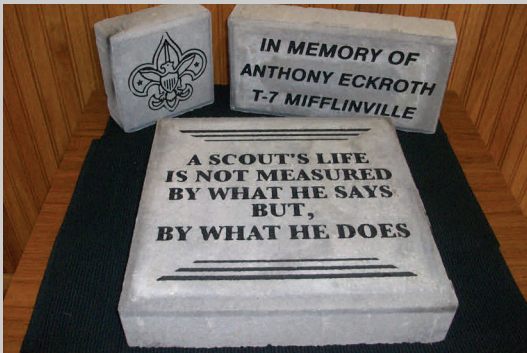
Samples of the 6" x 6", 6" x 12" and 12" x 12" pavers.

Your support will serve as a lasting, permanent legacy to Camp Lavigne in Benton, Pennsylvania. Proceeds from your paver purchase will support the construction of a new Campfire Circle to be located beside Clay Campsite. Each paver will be placed in the area directly in front of the raised stage. The anticipated completion of this project is the spring of 2013.